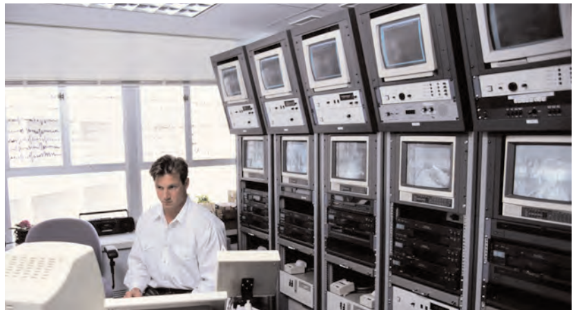
Technician monitoring volunteers in sleep laboratory

The first period of REM sleep you experience usually occurs about an hour to an hour and a half after falling asleep. After that, the sleep stages repeat themselves continuously while you sleep. As the night progresses, REM sleep time becomes longer, while time spent in non-REM sleep stages 3 and 4 becomes shorter. By morning, nearly all your sleep time is spent in stages 1 and 2 of non-REM sleep and in REM sleep. If REM sleep is disrupted during one night, REM sleep time is typically longer than normal in subsequent nights until you catch up. Overall, almost one-half your total sleep time is spent in stages 1 and 2 non-REM sleep and about one-fifth each in deep sleep (stages 3 and 4 of non-REM sleep) and REM sleep. In contrast, infants spend half or more of their total sleep time in REM sleep. Gradually, as they mature, the percentage of total sleep time they spend in REM progressively decreases to reach the one-fifth level typical of later childhood and adulthood.